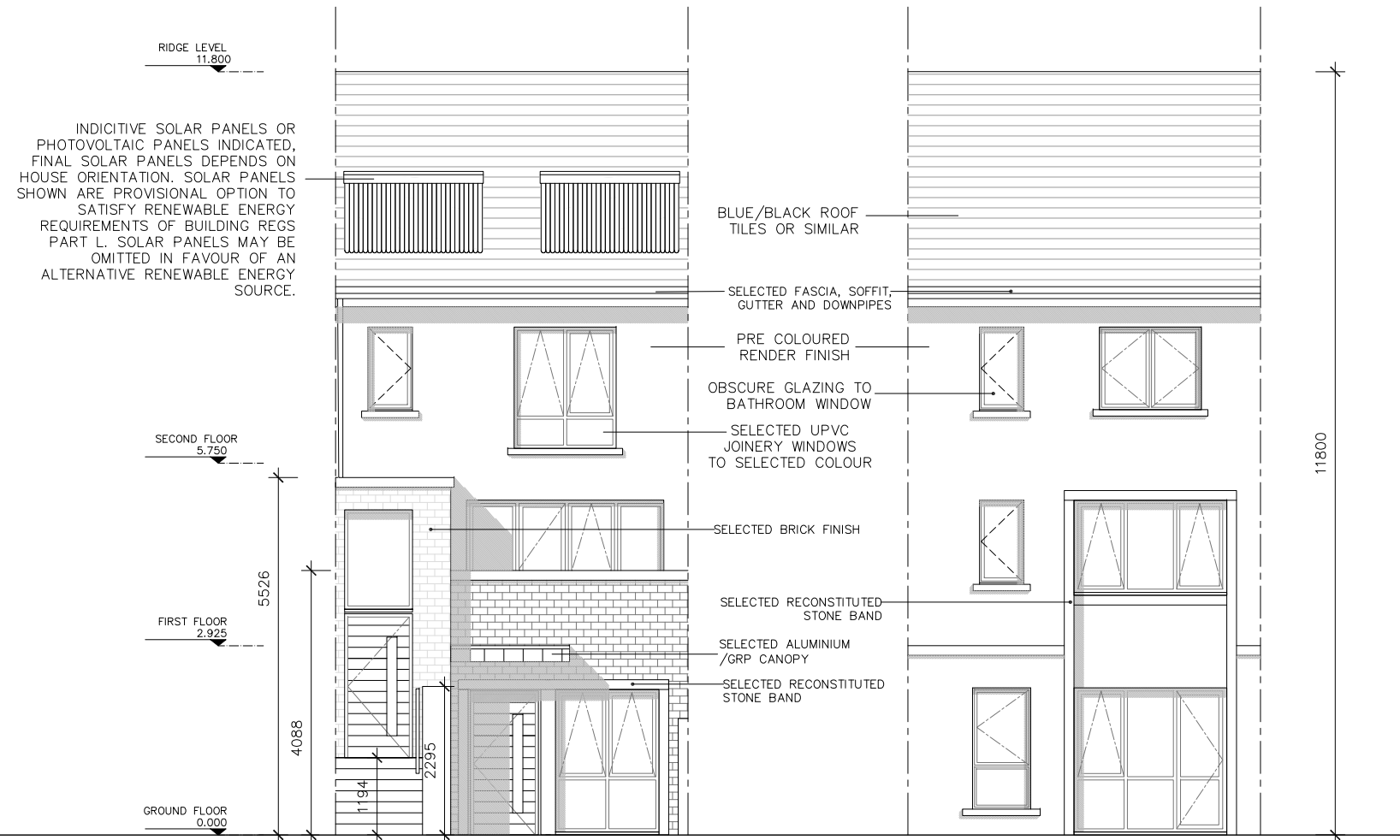
01 Front Elevation PA-D-302 1:100